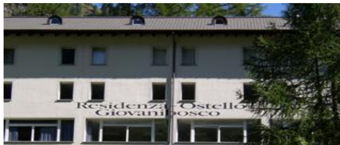
Dojo Residenza Ostello Giovanibosco

All participants must be privately accident-insured, also for medical treatment or hospitalization in Switzerland.